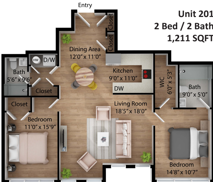
Unit 201 2 Bed / 2 Bath 1,211 SQFT